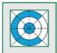
ANIMP'S CONSTRUCTION SECTION