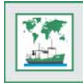
ANIMP'S LOGISTIC SECTION