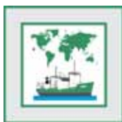
ANIMP'S LOGISTIC SECTION