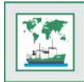
ANIMP'S LOGISTIC SECTION